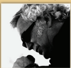
T. GRAHAM BROWN