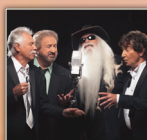
THE OAK RIDGE BOYS