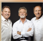
LARRY, STEVE & RUDY, THE GATLIN BROTHERS