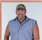
LARRY THE CABLE GUY